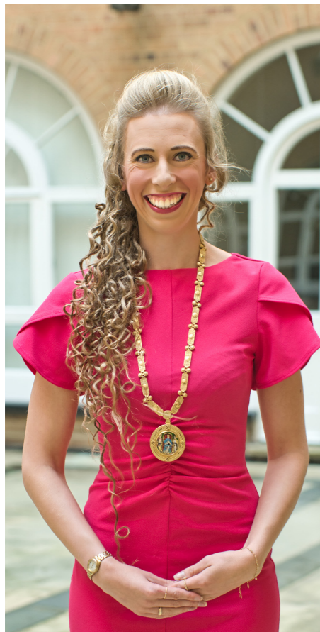
It has been an honour and a privilege to have been President of the Birmingham Law Society this year.

When I began my legal journey ten years ago, I never imagined that at the age of 31, I would take office as the youngest President of the Birmingham Law Society in its 205-year history. As someone who started out with no understanding of higher education, no legal work experience, and no connections, it was not a given that I would be able to navigate the legal profession, let alone be in a position to fulfil this role.